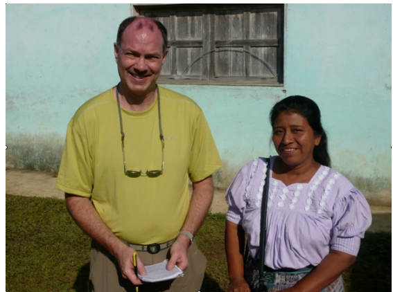
2010 Delegation Visit

What motivates people to join their lives and resources with others a world away? How does a unique school vacation experience end up transforming so many lives? How has this partnership created an opportunity for us to learn what it means to be faithful in a world torn by suffering, injustice, oppression and war? This panel will lead us thru an interactive discussion on how the partnership with Santa María Tzeja has enriched our lives in so many different ways.