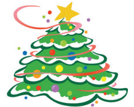
Giving Tree - 2012

There are still ornaments left on the giving tree, representing moms and children from the Elizabeth Stone House, a domestic abuse shelter in Boston. Each ornament will have information about each person's wish list, sizes and preferences. Please take an ornament, purchase 2-3 gifts, and drop off at the church by December 16th. All presents must be new and unwrapped.