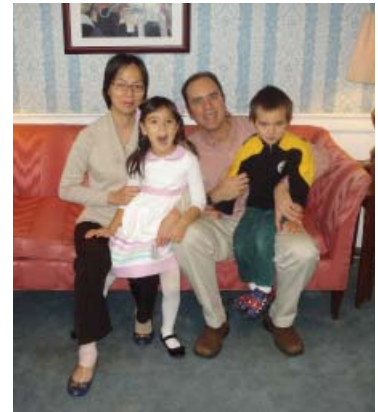
THE TIGNOR FAMILY